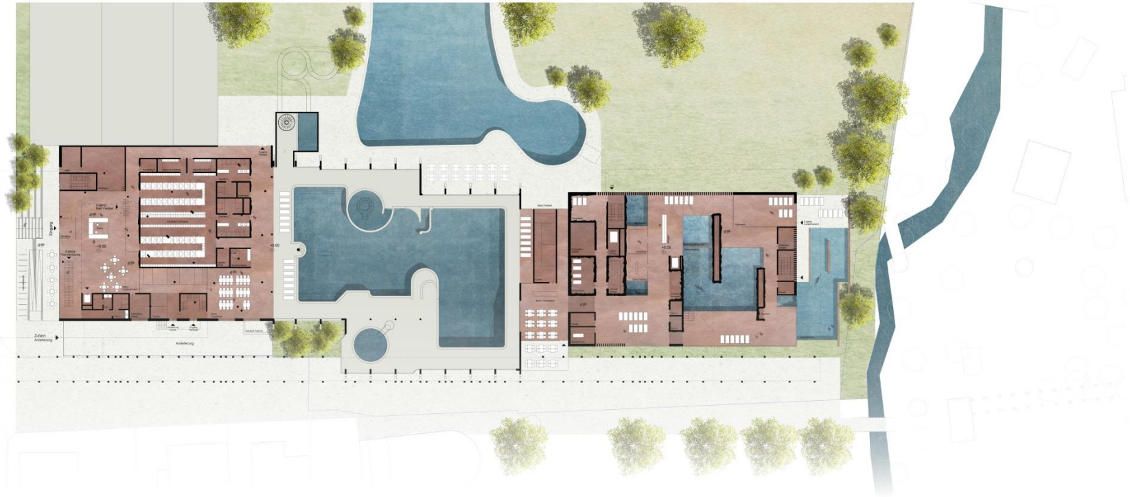
Grundriss Erdgeschoss M 1/200